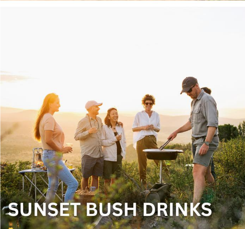
SUNSET BUSH DRINKS